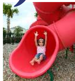
Children Play Area