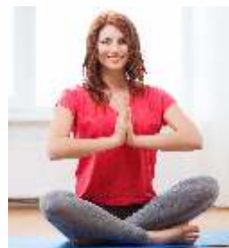
Yoga / Meditation