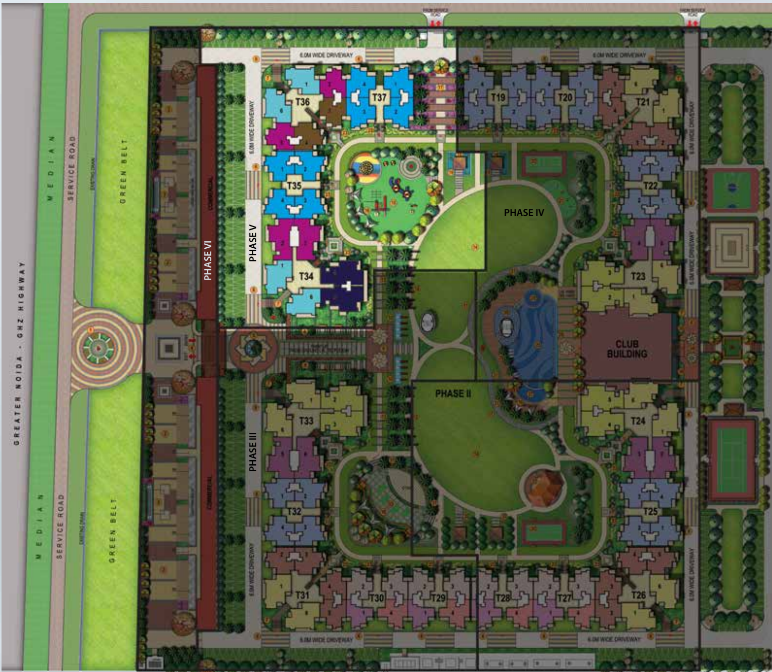
Note: The facilities & amenities mentioned above are part of different phase/project in total project, and will be available for use after development of respective phase/project.

All specifications, designs, layout, images, conditions are only indicative and some of these can be changed at the discretion of the builder/architect/authority. These are purely conceptual and constitute no legal offerings. 1sqm = 10.764 sq. ft.